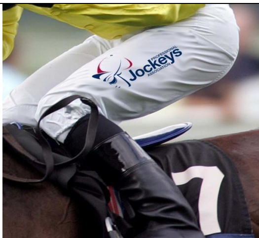
JOCKEYS' BREECHES (BOTH LEGS) THIGH SITE 32 SQ INS ALLOWED