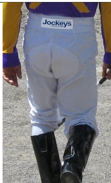
JOCKEY'S BREECHES COCCYX SITE 10 SQ INS ALLOWED

PLEASE REFER TO JOCKEY SPONSORSHIP CODE OF CONDUCT FOR FULL DETAILS OF SITES, SIZES, AND PERMITTED VISIBILITY