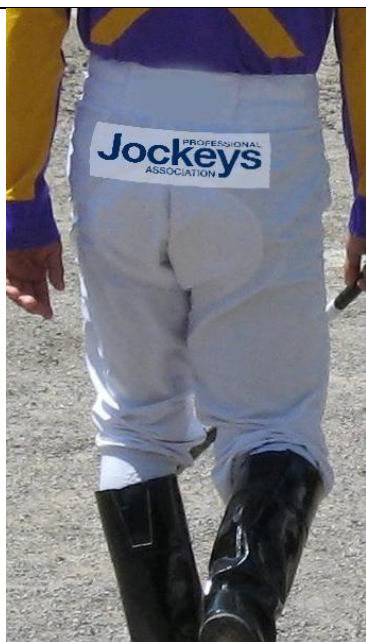
JOCKEY'S BREECHES POSTERIOR SITE 32 SQ INS ALLOWED