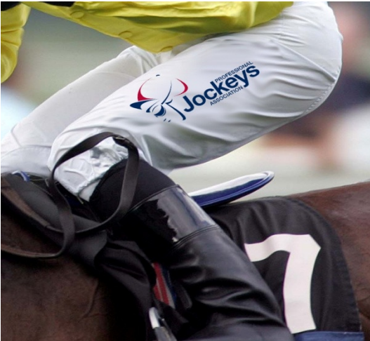
JOCKEYS' BREECHES (BOTH LEGS) THIGH SITE 32 SQ INS ALLOWED