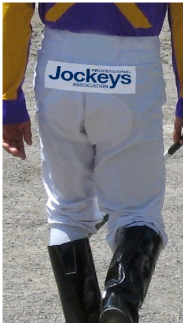
JOCKEY'S BREECHES POSTERIOR SITE 32 SQ INS ALLOWED