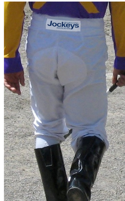
JOCKEYS' BREECHES COCCYX SITE 10 SQ INS ALLOWED

PLEASE REFER TO JOCKEY SPONSORSHIP CODE OF CONDUCT FOR FULL DETAILS OF SITES, SIZES, AND PERMITTED VISIBILITY